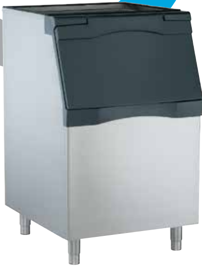
B530S show with optional KLP8S legs.